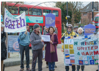
Campaigning for action on warm homes.

There is a climate crisis and no time to waste. In our first week in power, Labour has already scrapped the Tory onshore wind ban as part of our mission for clean power by 2030, to lower bills and make Britain energy independent.