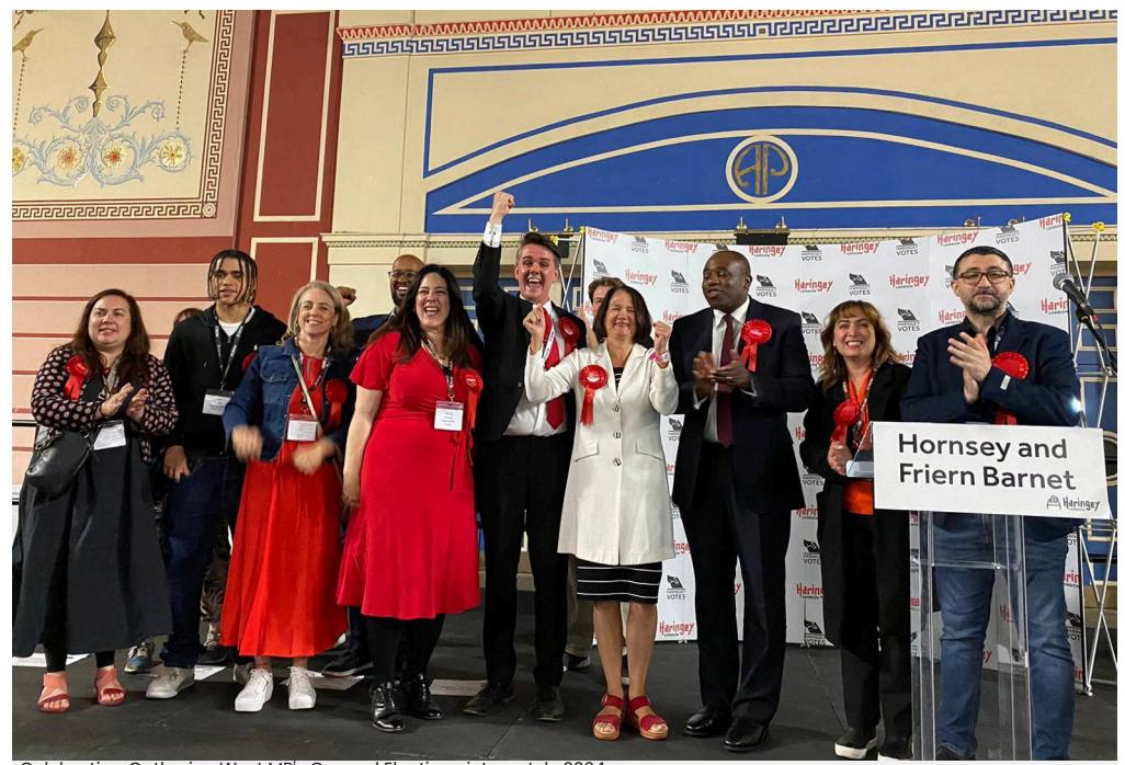
Celebrating Catherine West MP's General Election victory, July 2024

It is a huge honour to have been elected as your Member of Parliament for Hornsey & Friern Barnet and your voice in Westminster. Thank you for putting your trust in me once again.