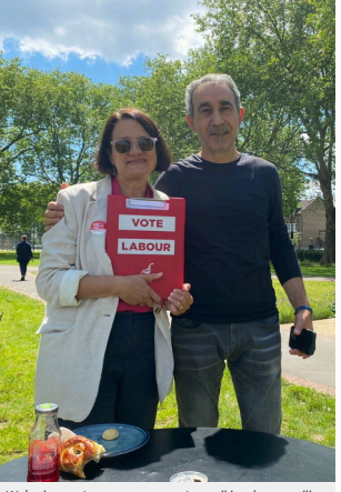
We're home to so many great small businesses like Cafe Raj in Ducketts Common.

If you're a local business owner, get in touch to let me know the issues that concern you.